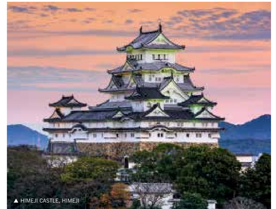
▲ HIMEJI CASTLE, HIMEJI

Located a five-minute walk from JR Osaka Train Station, Hotel Monterey Osaka is well-located for travellers. Guest rooms are designed to look like rooms in Vienna's Schönbrunn Palace, and have free wifi. The hotel overall emanates an atmosphere reminiscent of the Austrian royal court.