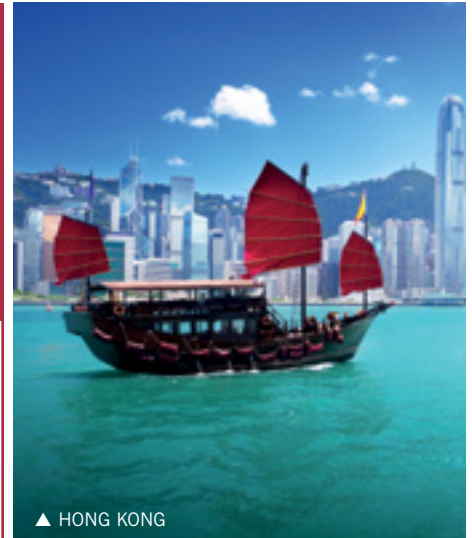
▲ HONG KONG