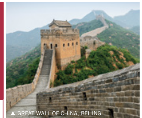
▲ GREAT WALL OF CHINA, BEIJING