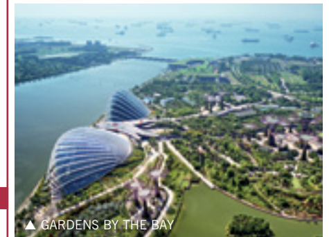
▲ GARDENS BY THE BAY