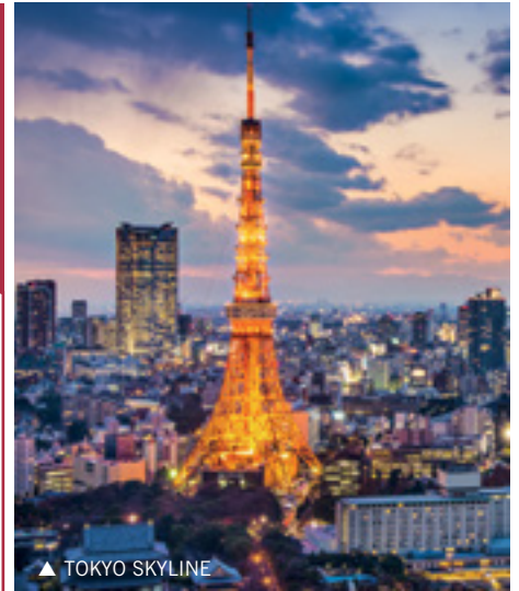
▲ TOKYO SKYLINE