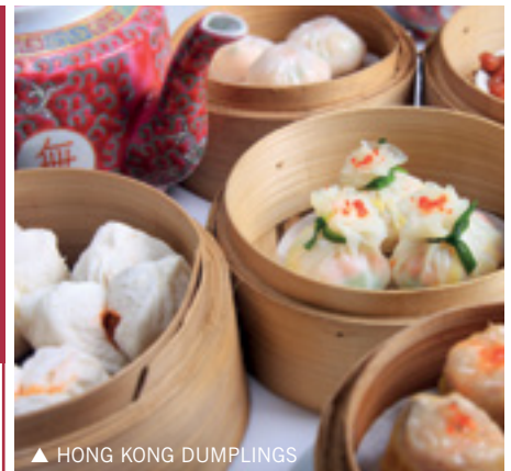
▲ HONG KONG DUMPLINGS