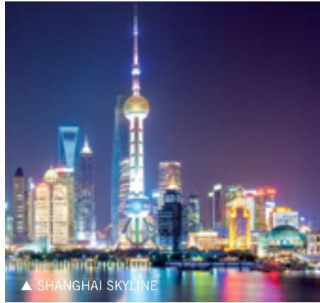
▲ SHANGHAI SKYLINE