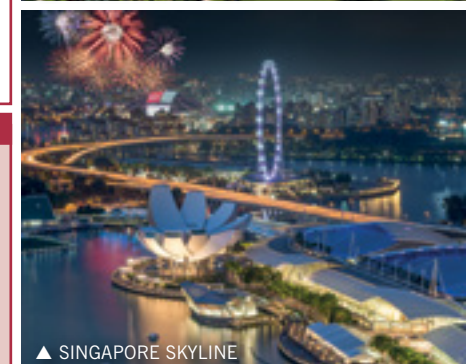
▲ SINGAPORE SKYLINE