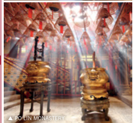
▲ PO LIN MONASTERY