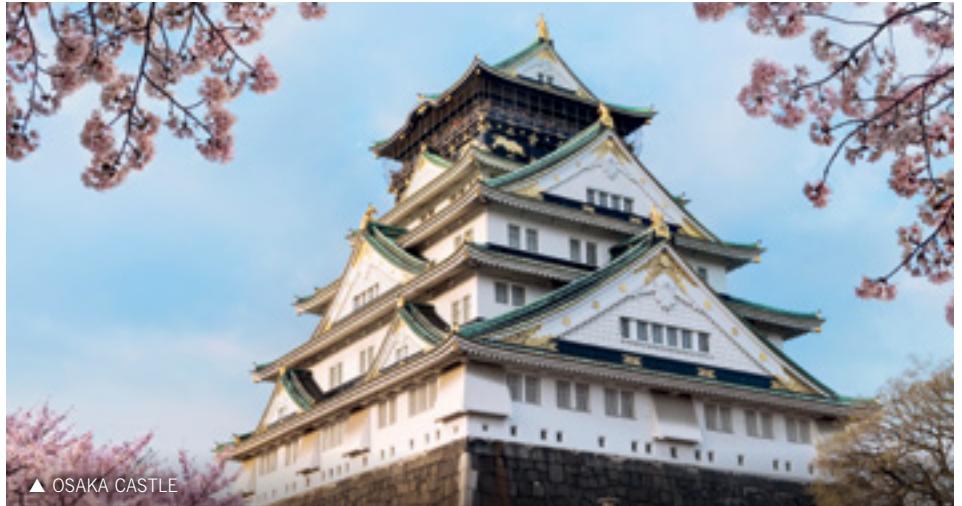
▲ OSAKA CASTLE