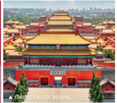
▲ FORBIDDEN CITY, BEIJING