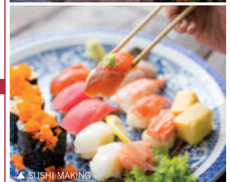
▲ SUSHI MAKING