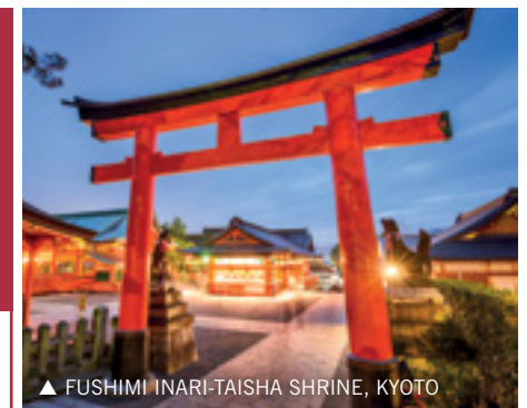
▲ FUSHIMI INARI-TAISHA SHRINE, KYOTO