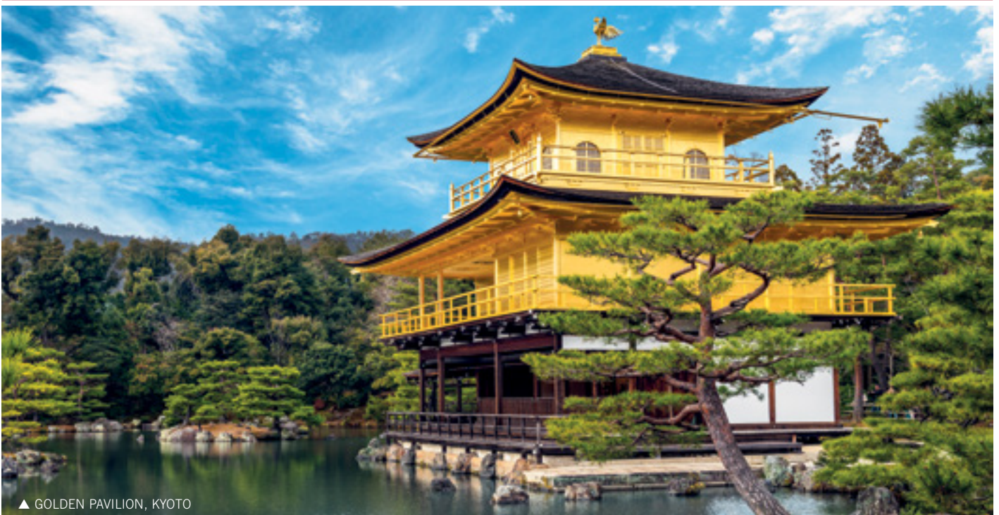
▲ GOLDEN PAVILION, KYOTO