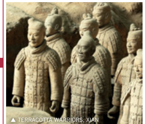
▲ TERRACOTTA WARRIORS, XIAN