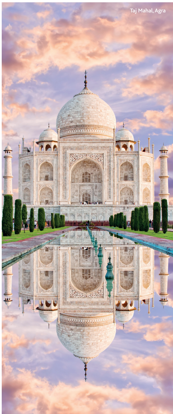
Taj Mahal, Agra