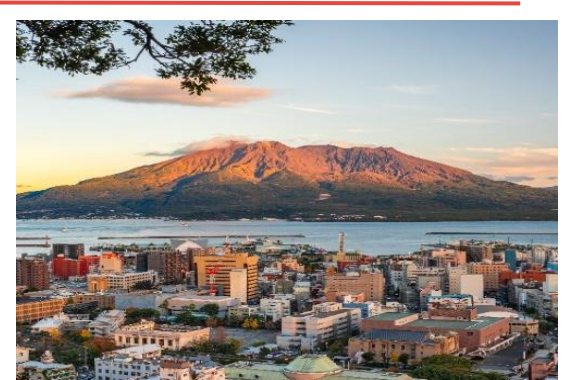
Meals: B, L, D