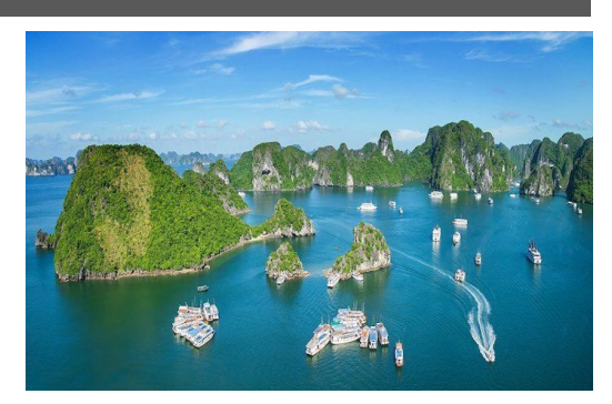
Meals included: Breakfast, Lunch, Dinner

which require climbing up and down steps inside and outside of the caves. End the day on deck to watch the sunset over the bay followed by a freshly prepared dinner, before retiring to your cabin for the night.