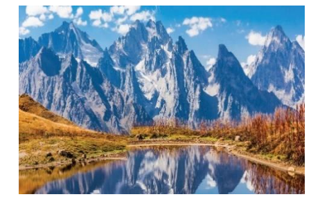
Day 18: Ushguli Meals: B, L, D

After breakfast set off to explore Ushguli, a cluster of five villages reached via 4x4 vehicles due to its rugged terrain. It will take 2 hours to reach here. Your visit includes the Svaneti Museum of History and Ethnography, shedding light on the region's rich cultural heritage. Lunch will be prepared as you participate in a Kubdari masterclass, a traditional Svan dish, at a local family's home. After spending 3 hours here, you will return to Mestia for dinner.