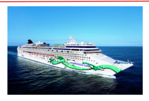
Day 19: Cruising — Nagasaki

Spend today at sea enjoying what your cruise ship, Norwegian Jade, has to offer.