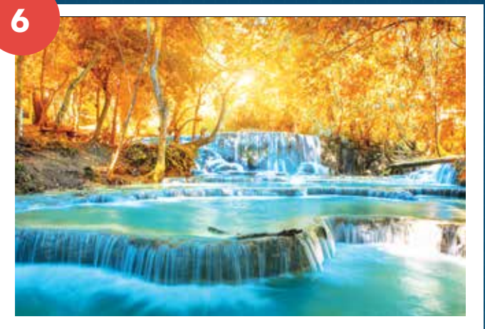
Kuang Si Waterfalls

HIDDEN TREASURES OF MYANMAR. 17 DAYS FROM $5,490pp